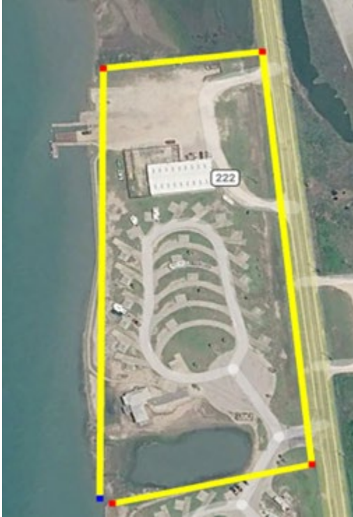
Zone 4: South loop RV park and waterfront searched by EPC and one counselor.